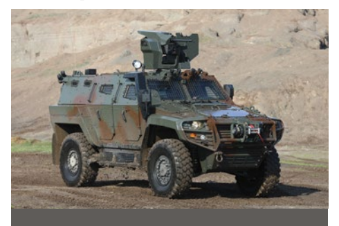
INTERNAL SECURITY VEHICLE