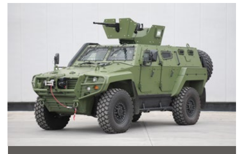
PERSONNEL CARRIER WITH OPEN CUPOLA