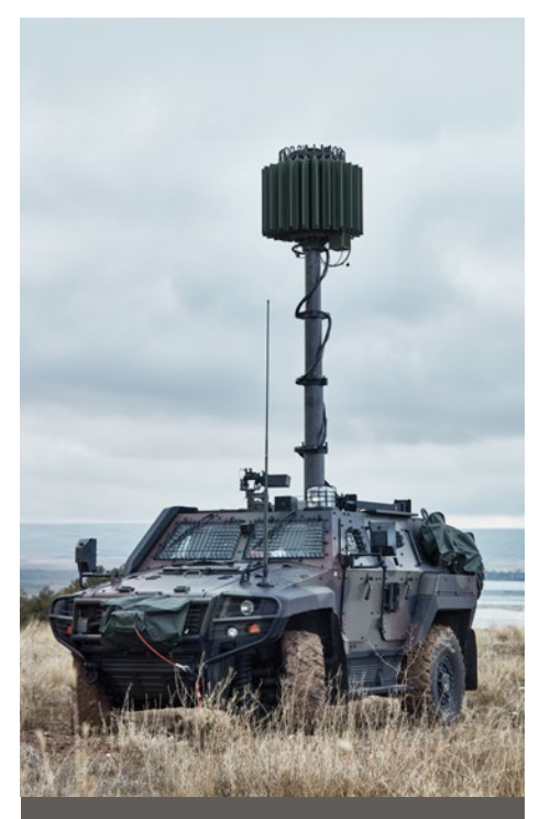
MORTAR FIRE DETECTION RADAR VEHICLE