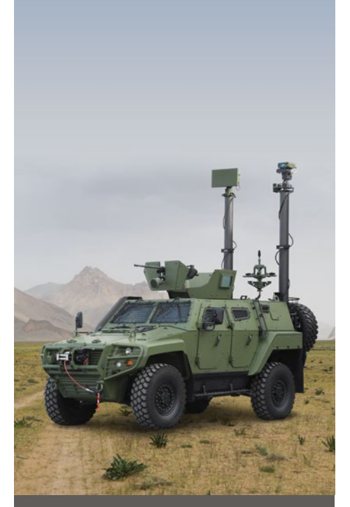
RECONNAISSANCE AND SURVEILLANCE VEHICLE