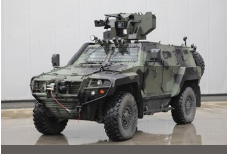
PERSONNEL CARRIER WITH DUAL RCWS