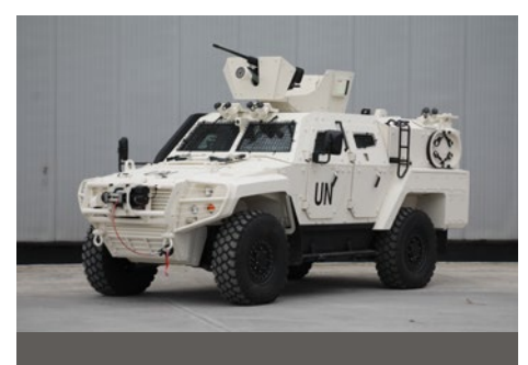
COMMAND AND CONTROL VEHICLE