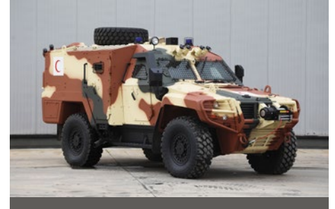
FIELD AMBULANCE / MEDICAL EVACUATION VEHICLE